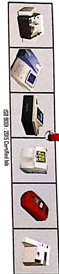
ISO 9001 : 2015 Certified lab