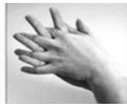
Palm to palm fingers interlace