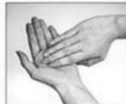
Rotational rubbing backwards and forwards with clasped fingers on right hand in left palm and vice versa