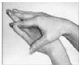
Right palm over left dorsum and left palm over right dorsum