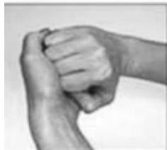
Backs of fingers to opposing palms with fingers interlocked