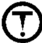
Poisonous and Infectious Material (Materials Causing Other Toxic Effects)