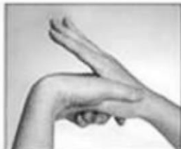
Rotational rubbing of right thumb clasped in the left palm and vice versa