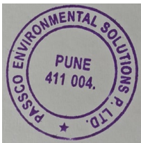
Mr. Satish Satarkar Authorised Signatory

Note : HCE shall display copy of Registration Certificate at front Desk and Temporary BMW storage area.